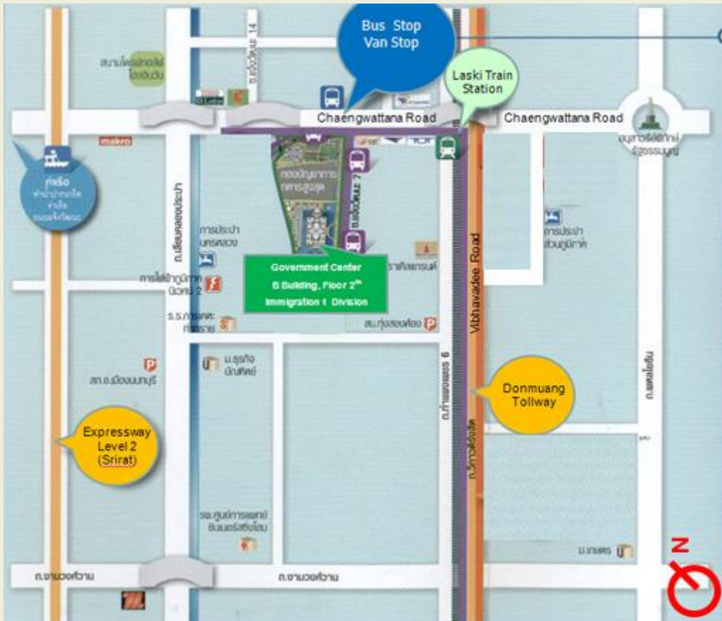
MAP Indoor B Building, Floor 2

Government Center Chaengwattana Building B , No. 120 , Moo 3 , Chaengwattana Road , Tungsohong Sub-District , Laksi District , Bangkok 10210 (As shown in the map) Tel : 0-2141-9889 , Fax : 0-2143-8228